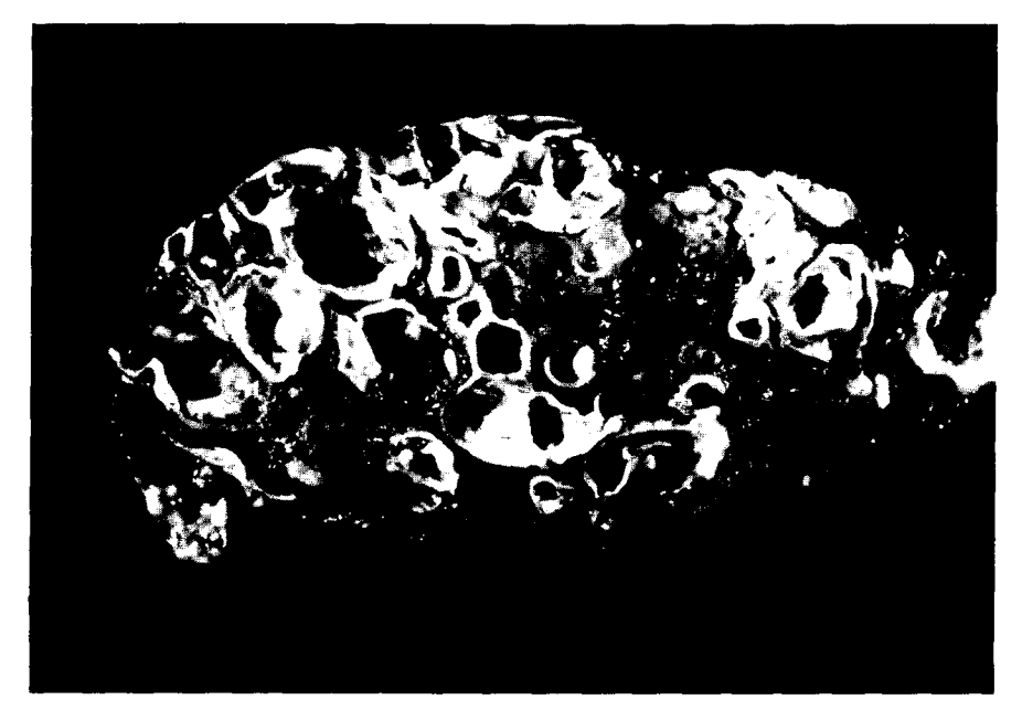
FIG. 1. Lung lobe from alligator with mycotic pneumonia. Note dilated bronchi and bullae lined with white masses of fungal hyphae.

At necropsy, the animal appeared to be in excellent nutritional condition and had large amounts of abdominal and subcutaneous fat. The heart, thyroid gland, liver, testis, skeletal muscle, and subcutaneous fat showed no abnormalities. Significant findings were limited to the lungs, the surface of which was irregular. On the cut surface, there were multiple 2–4 mm pale white necrotic foci scattered throughout the parenchyma. There was bronchiectasis and emphysematous bullae formation. Many dilated bronchi were lined with white plaques of fungal hyphae (Fig. 1). The upper respiratory tract including the trachea and major bronchi showed no lesions.