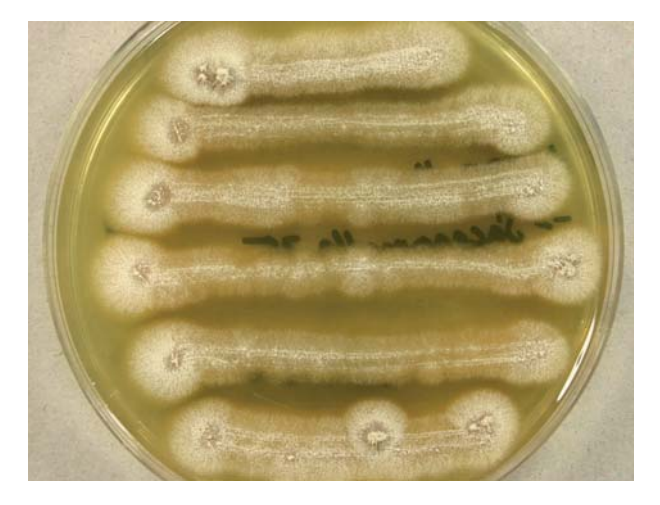
Fig. 2 Phialosimplexcaninus (UAMH 10337) grown on potato dextrose agar at 25°C for 14 days showing yellowish-white colonies and yellow diffusible pigments.

1.8–3.7 \mu m wide and those in heads being obovoid and measuring 2–4.5 \mu m long by 1.5–3.2 \mu m wide.