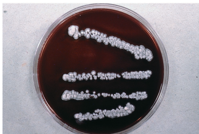
FIG. 3. Colony of Cylindrocarpon sp. (UAMH 8935) on potato dextrose agar incubated at room temperature. (Top) After 11 days, showing presence of some diffusible pigment. (Bottom) Same plate after 3 months, showing strong reddish brown diffusing pigment.

after prolonged incubation (3 to 14 weeks at room temperature) and consisted of zero- to one-septate, cylindrical, sometimes slightly curved, conidia produced from unbranched septate phialides without collarettes (Fig. 4A). Single-celled conidia measured 9 to 14 µm long and 2 to 2.5 µm wide, and two-celled conidia measured 17 to 25 µm long by 2 to 3 µm wide. Chlamydospores were mostly solitary, intercalary or terminal, and were subglobose, smooth to slightly roughened (Fig. 4B).