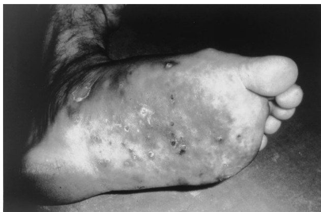
FIG. 1. Swollen left foot of the patient, showing discharging sinuses.

surrounded by intact neutrophils. There was no histologic evidence of a coexisting infection, and foreign materials such as thorns were not detected either within or near the granules.